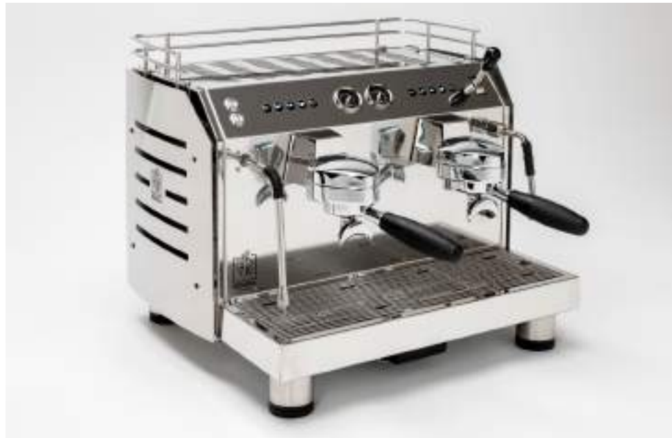
Family Compact 2 groups Inox LATTE ART