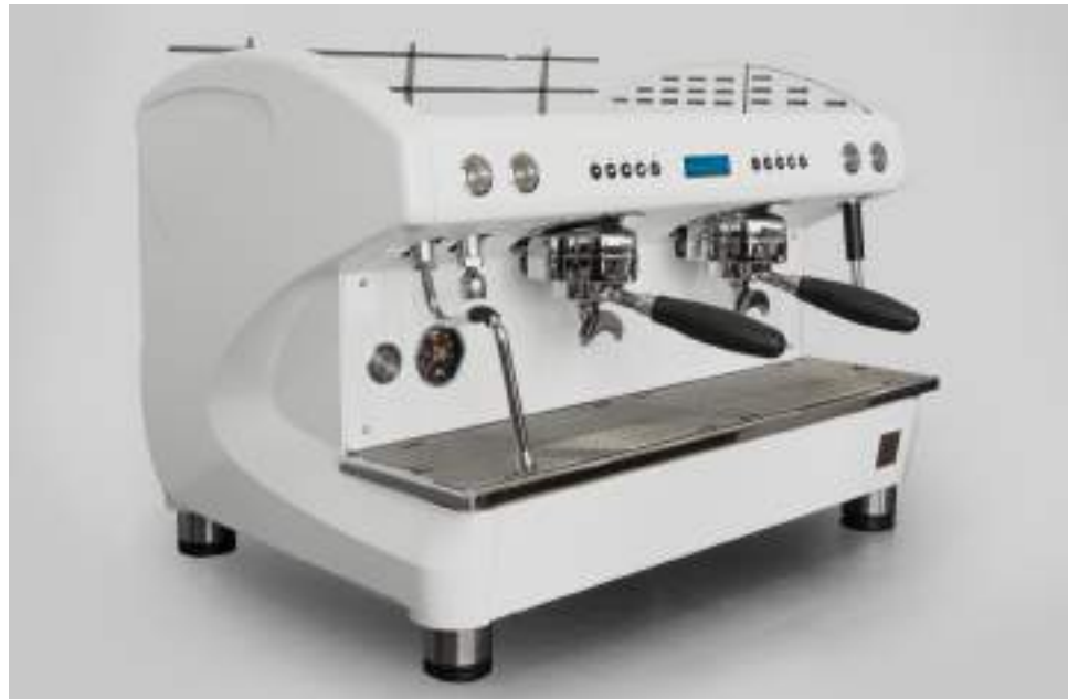
Life 2 groups WHITE SERIES & LATTE ART