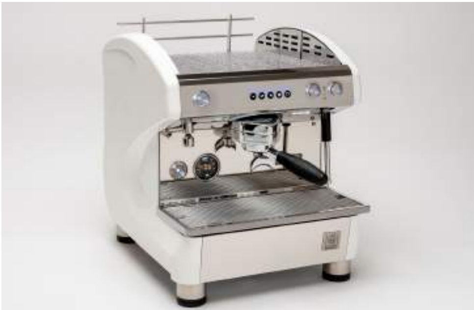
Life 1 group LATTE ART