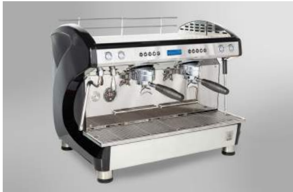
Life 2 groups HIGH CUP & LATTE ART