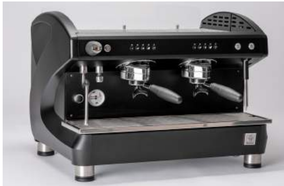
Viva 2 groups BLACK SERIES & LATTE ART