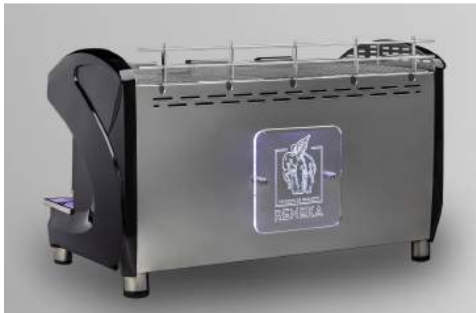
Life 3 groups HIGH CUP & LED backlit plaque