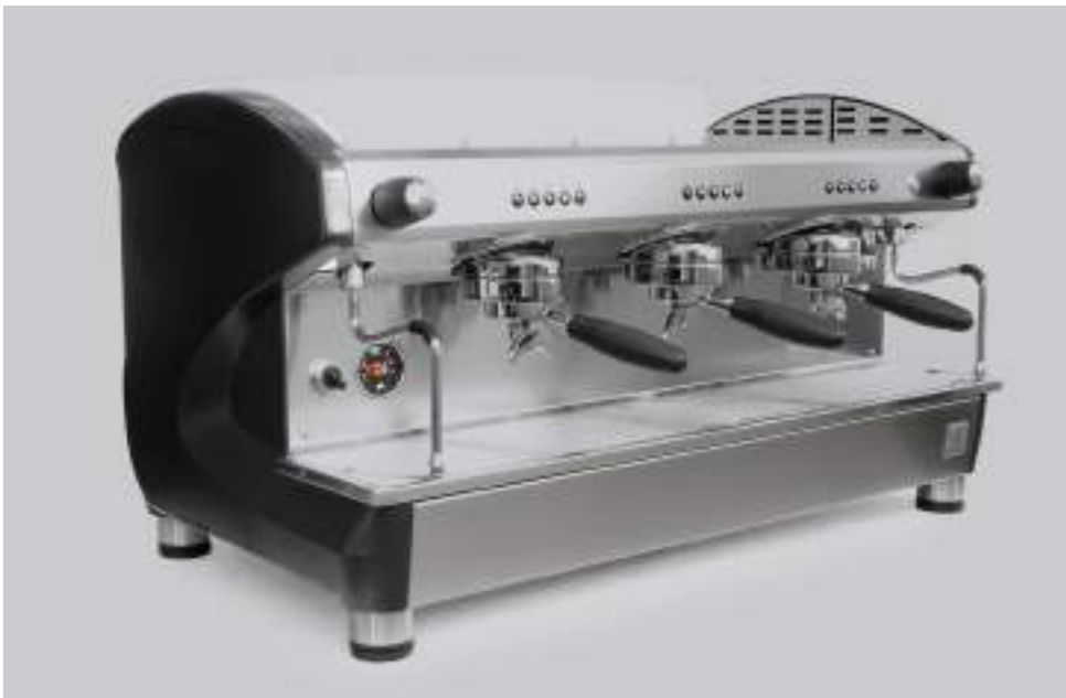
Viva 3 groupes