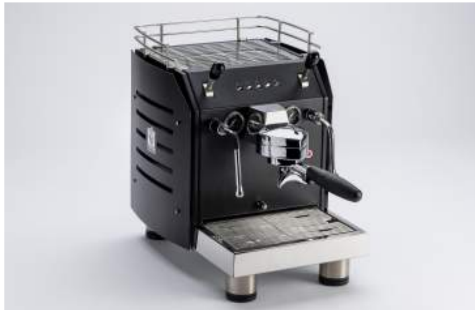
Family Compact 1 group Black