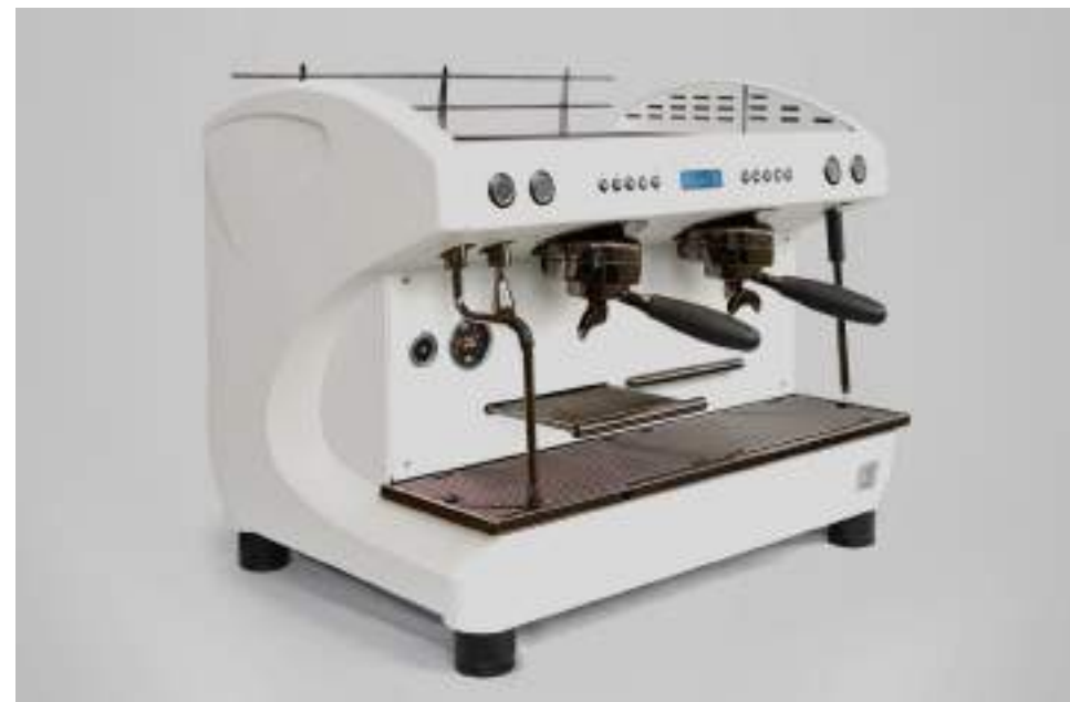
Life 2 groups DARK WHITE, HIGH CUP & LATTE ART