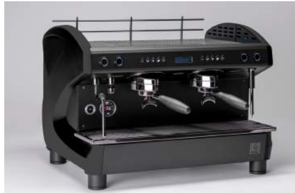
Life 2 groups BLACK SERIES & LATTE ART