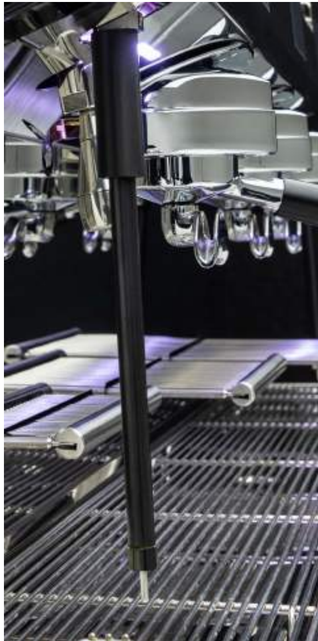
PEEK plastic options: A strong and rigid plastic who works over a wide temperature range and is completely nonstick.