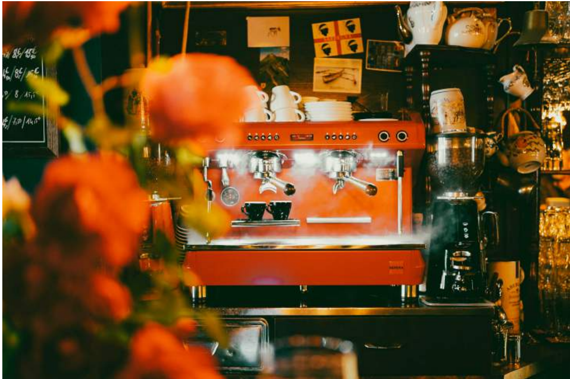
Life 2 HIGH CUP & LATTE ART. Custom color: for more information, please contact our sales agents.