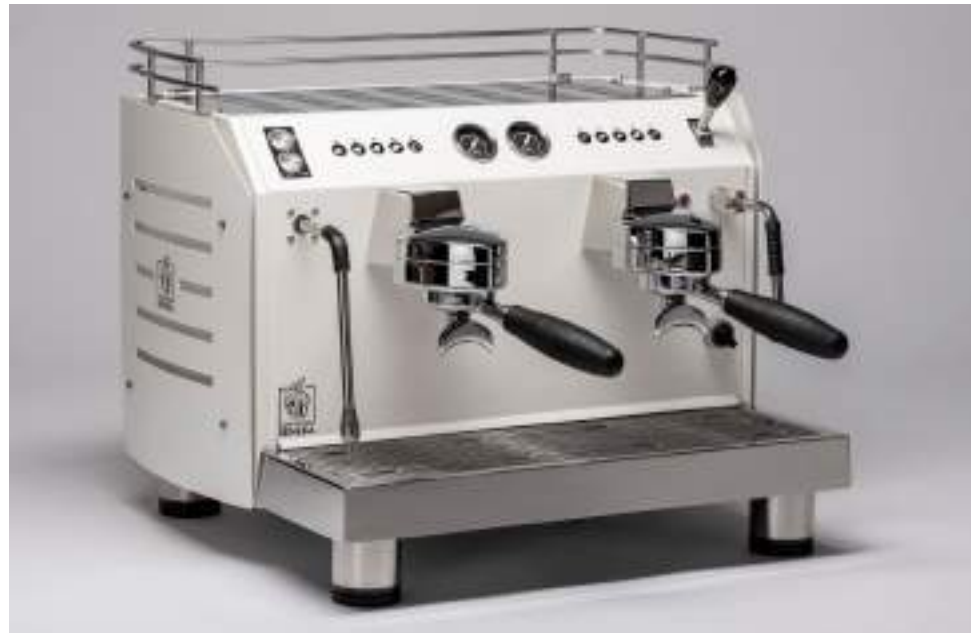
Family Compact 2 groups White LATTE ART