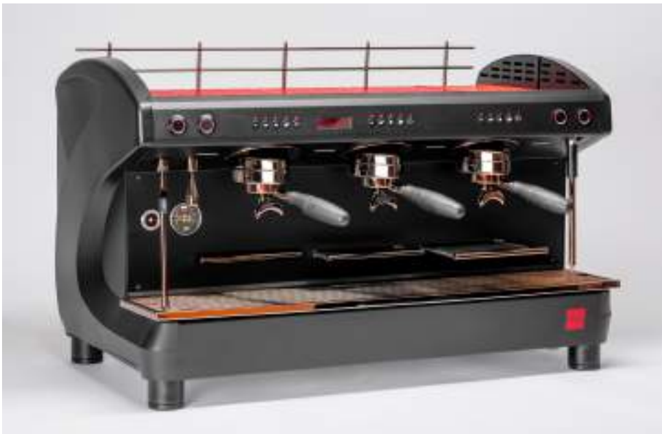
Life 3 groups HIGH CUP, LATTE ART & DARK EDITION