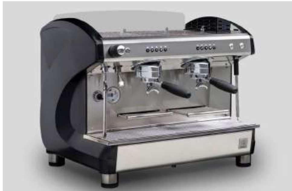
Viva 2 groups HIGH CUP & LATTE ART