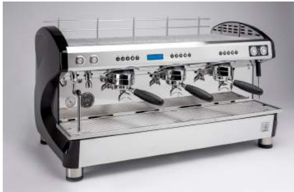
Life 3 groups LATTE ART