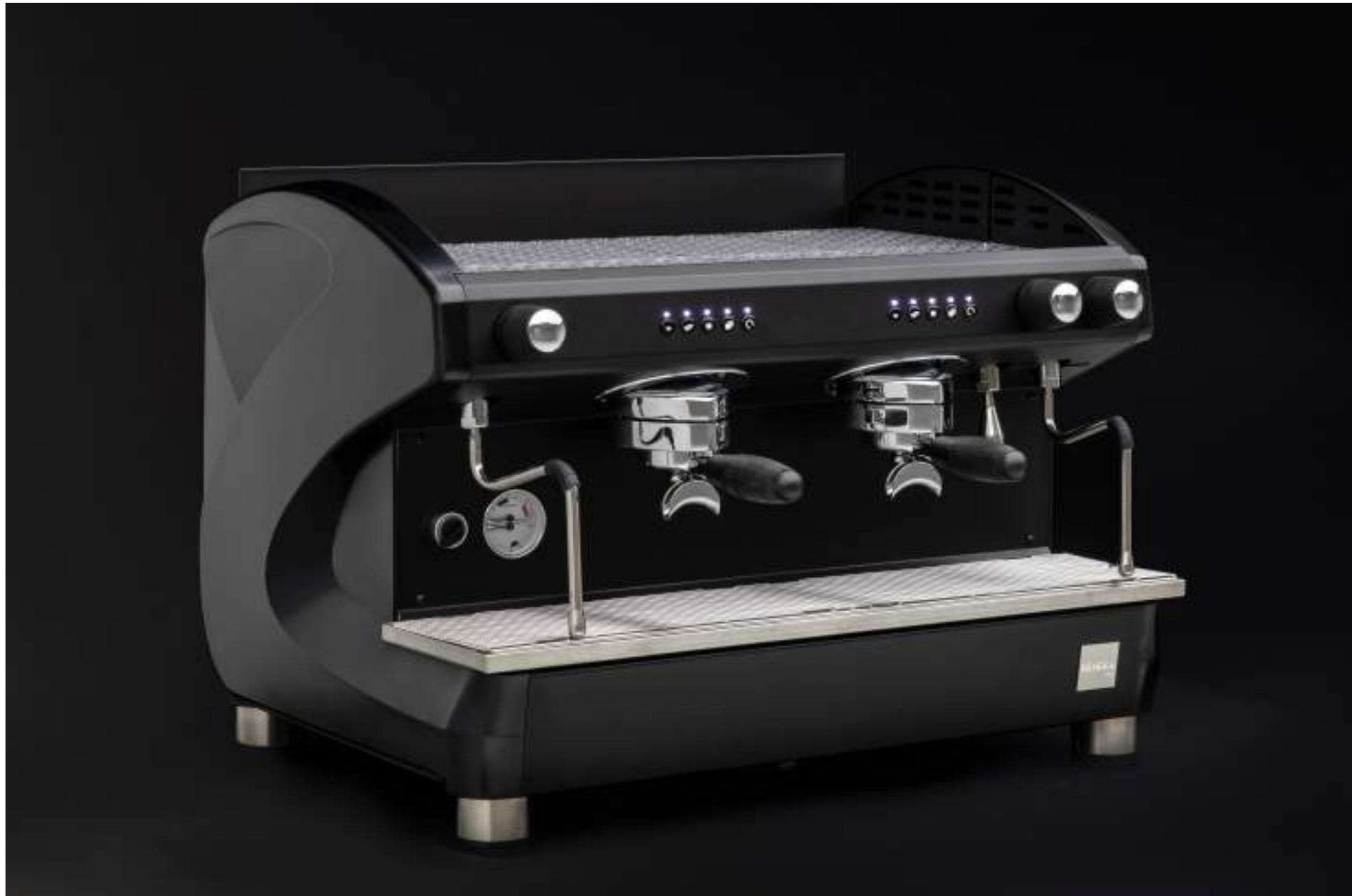
Viva Basic 2 groups