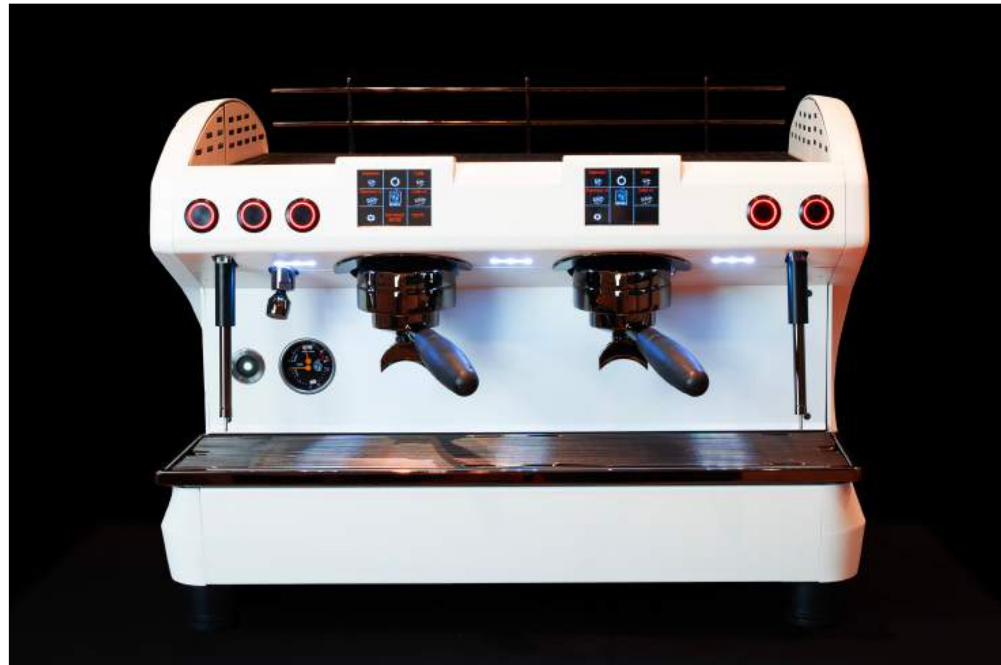
Life Touch 2 groups WHITE SERIES & Double LATTE ART