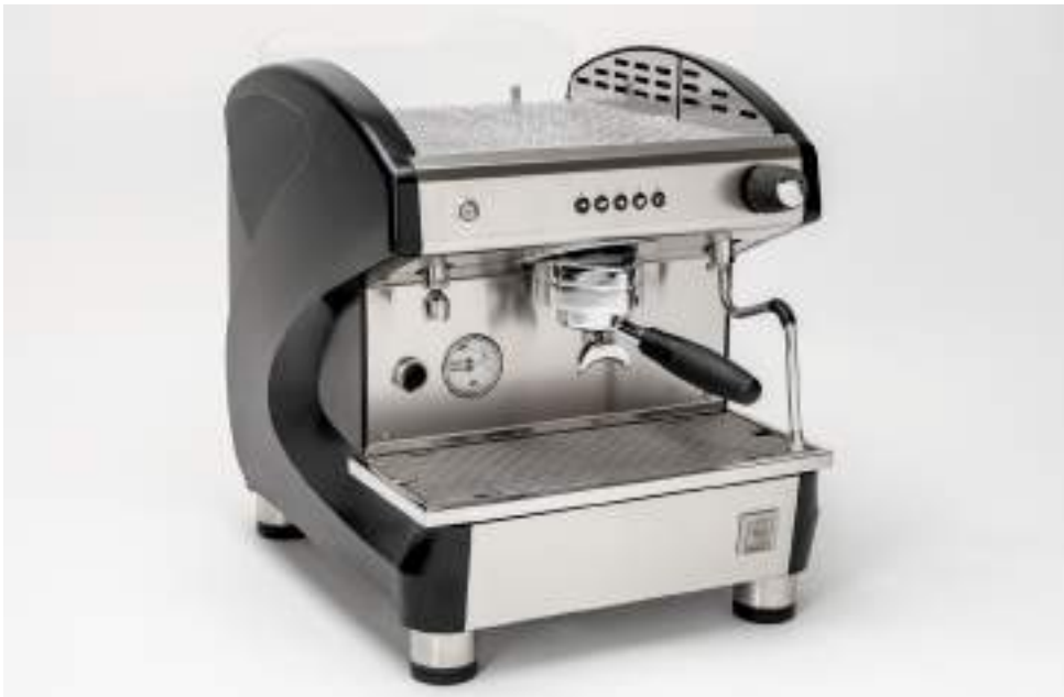
Viva 1 group