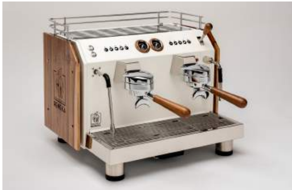
Family Compact 2 groups LATTE ART & wood option